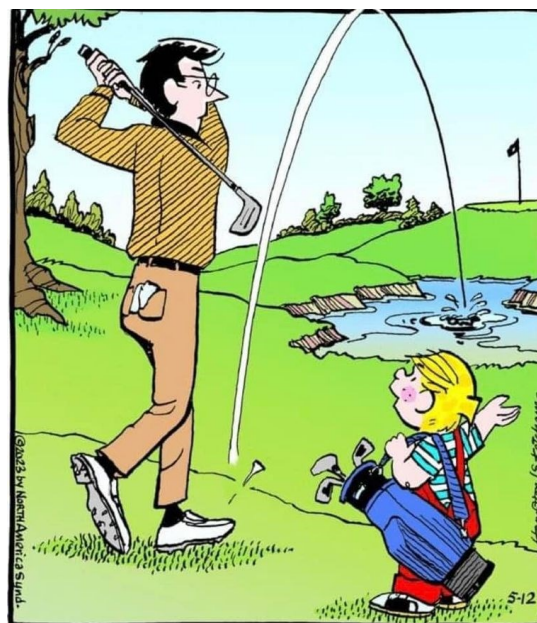
"MAYBE YOU SHOULD TRY BOWLING, DAD... AT LEAST THEY HAVE A BALL RETURN!"